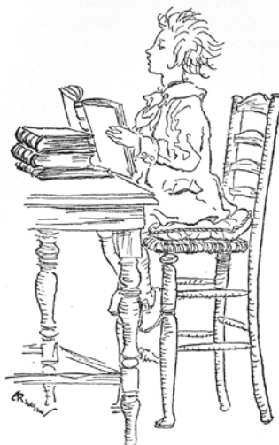
TO READ THE LESSONS OF THE DAY